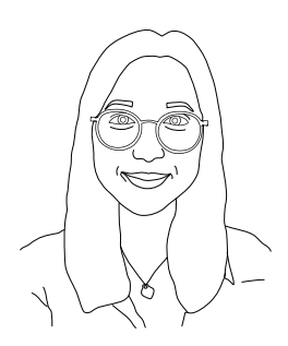
Zoë Strub Public Relations