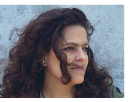
Go and Tell the Sea