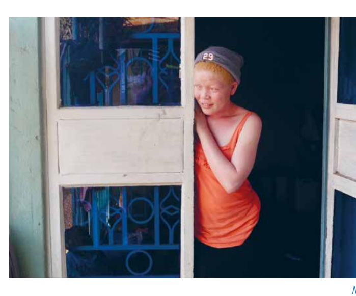
Ndi Mulungi Mu Langi Yonna