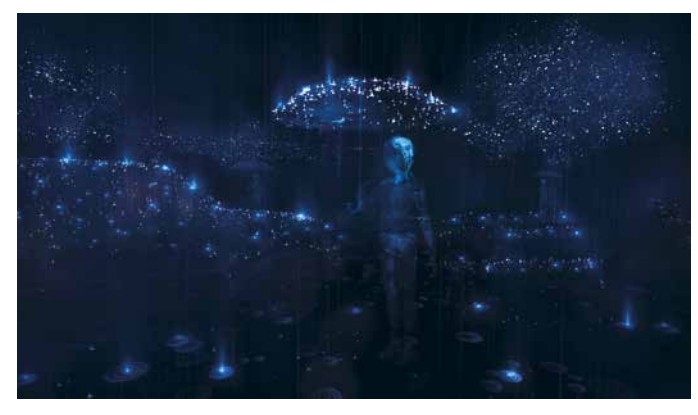
Notes on Blindness