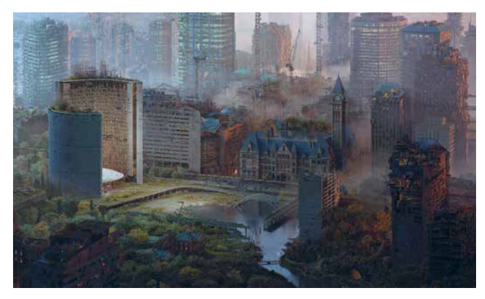
Biidaaban: First Light