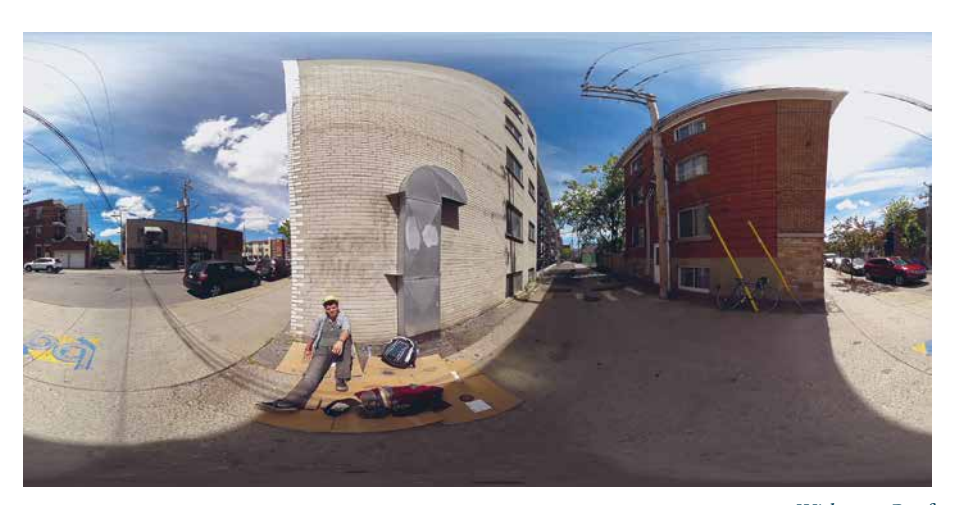
Without a Roof