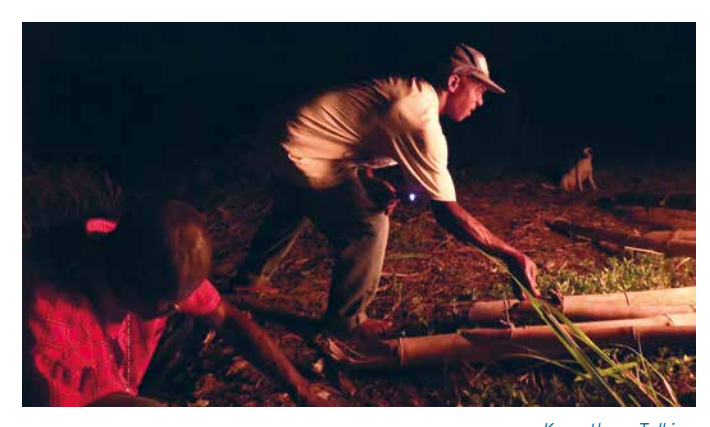
Keep them Talking