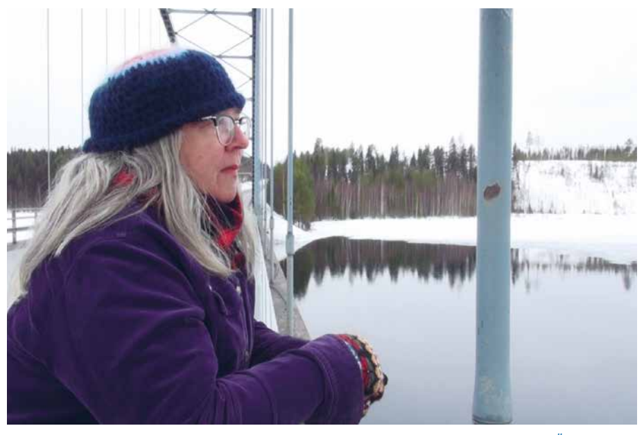
Älven min Vän