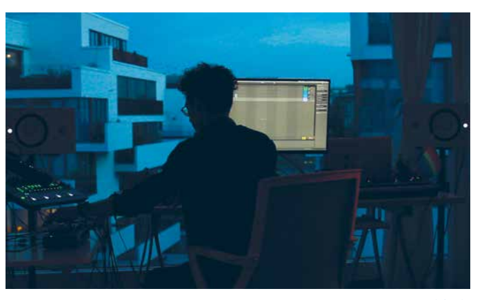
Between Beats and Code