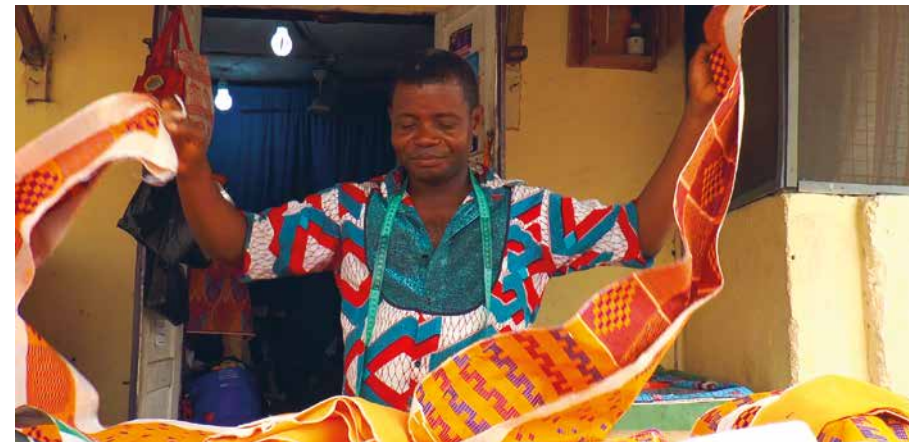
Unity: Dress-Scapes of Accra