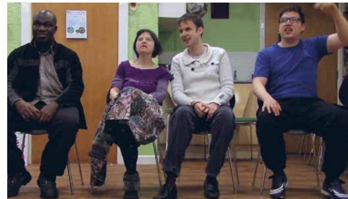
An Improvised Reality