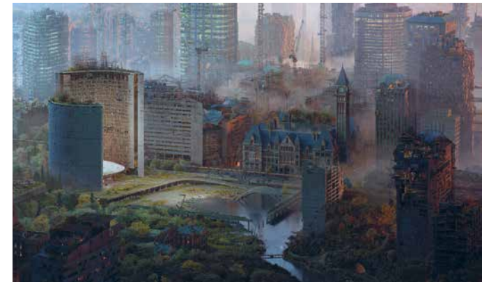
Biidaaban: First Light