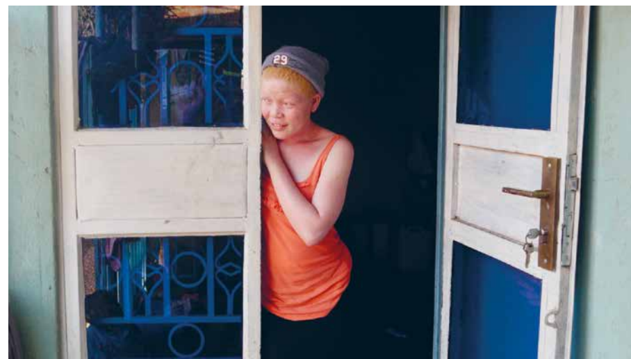
Ndi Mulungi Mu Langi Yonna