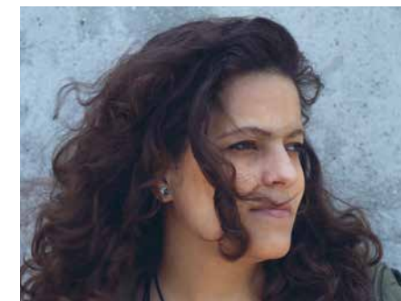
Go and Tell the Sea