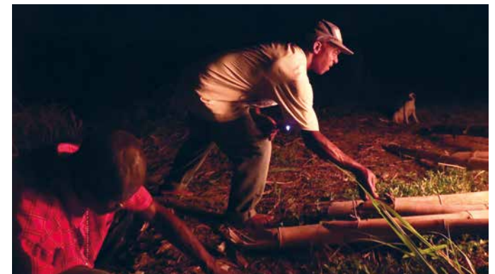
Keep them Talking