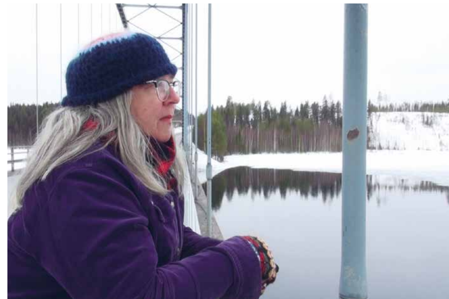
Älven min Vän