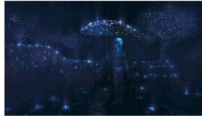
Notes on Blindness