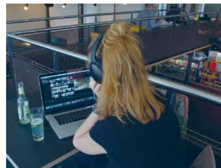
Hinter der Kamera