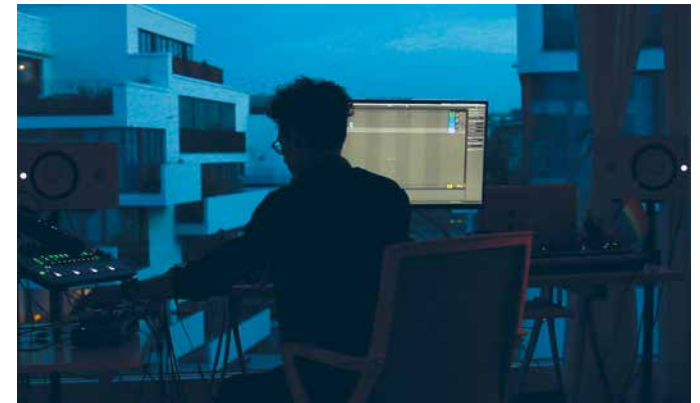
Between Beats and Code