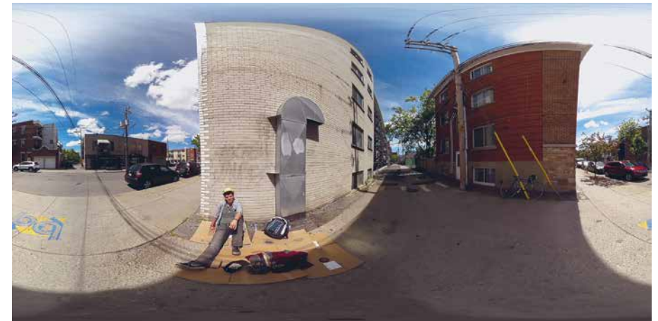
Without a Roof