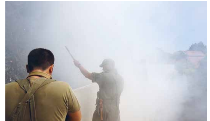
The Feel of History